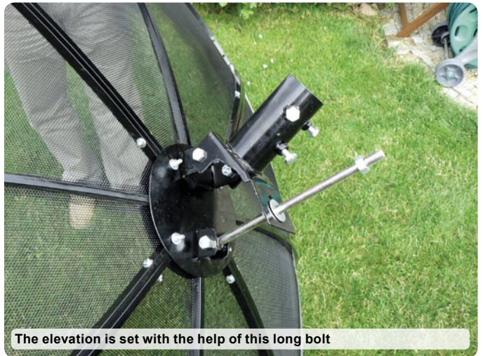
The elevation is set with the help of this long bolt