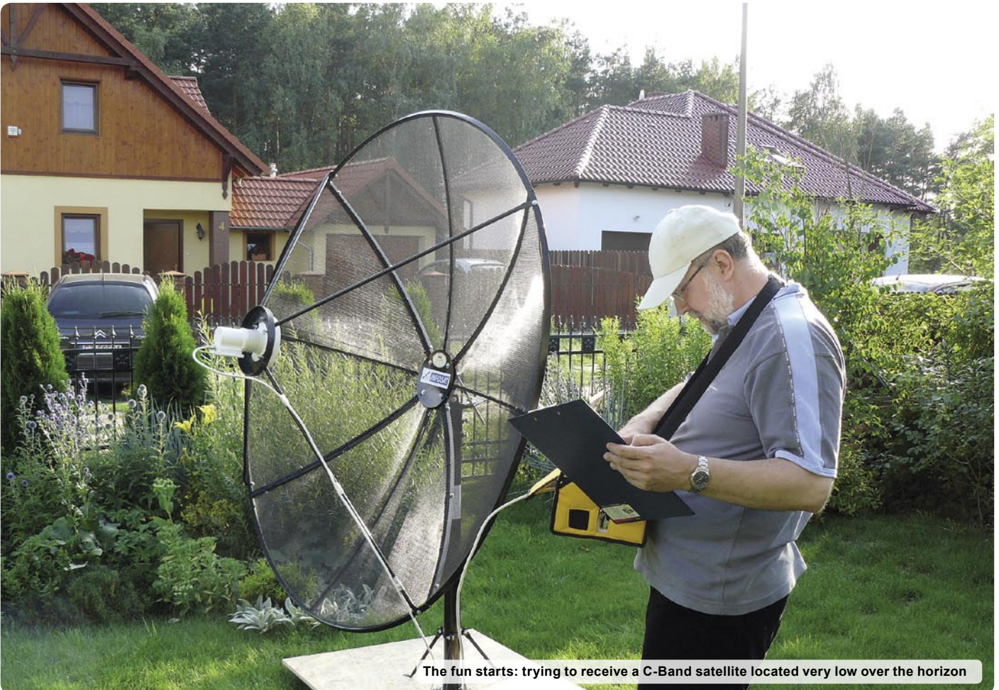
The fun starts: trying to receive a C-Band satellite located very low over the horizon

not located on the roof of a skyscraper.