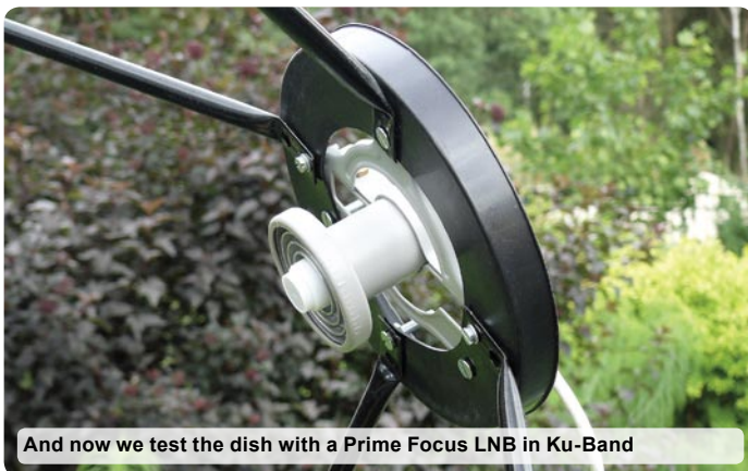
And now we test the dish with a Prime Focus LNB in Ku-Band

The V055 is a lightweight mesh dish which can easily be erected in a garden. It's size of 1.65m diameter is the minimum required in Europe for C-band reception, but is sufficient in other regions with more high-power C-band satellites. The advantage of the V055 is it's ease of assembly, and that it fits easily into a garden. It's best used as a fixed dish for a high-power C-band satellite.