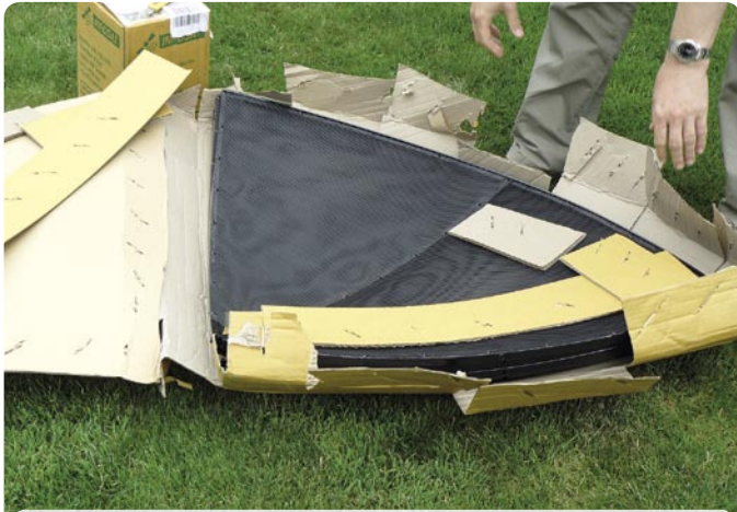
The 4 parts of the reflector are protected with cardboard