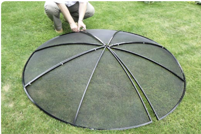
Assembly of the reflector was quite easy due to the very low weight