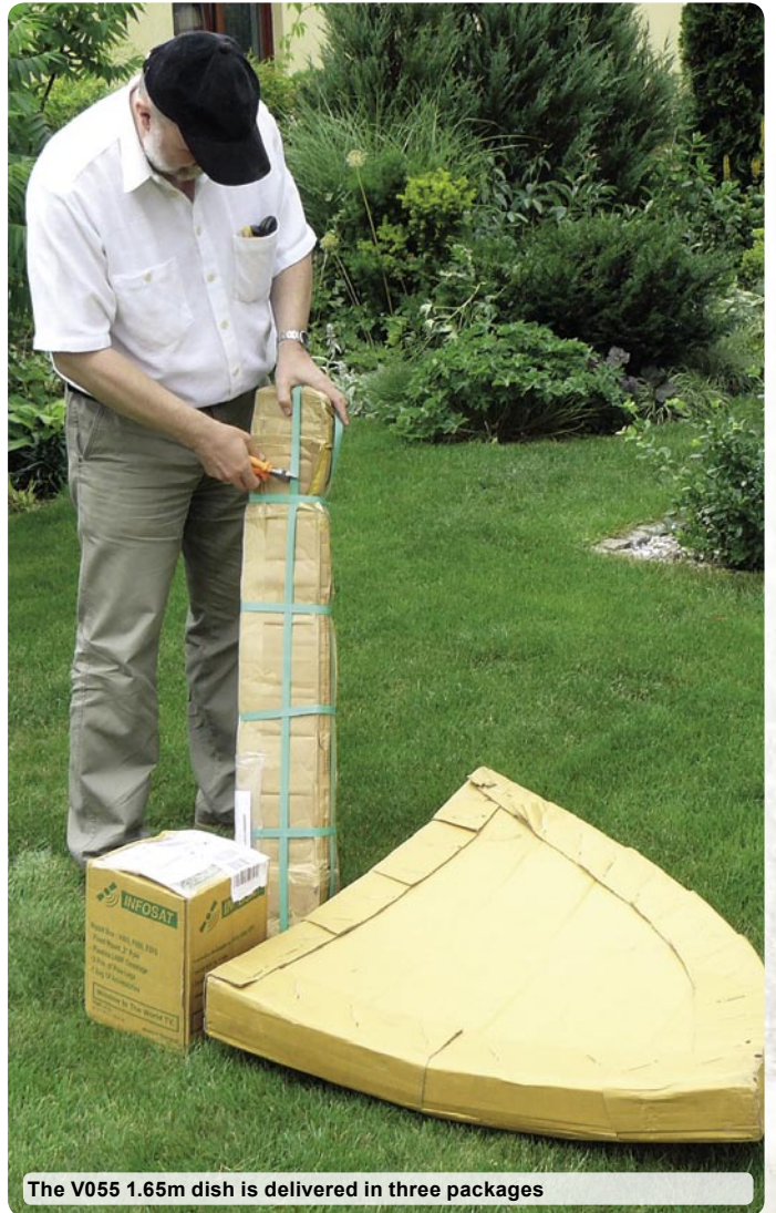
The V055 1.65m dish is delivered in three packages

After mounting the reflector on the pole, the last step to do was the installation of four legs supporting the LNBF. It