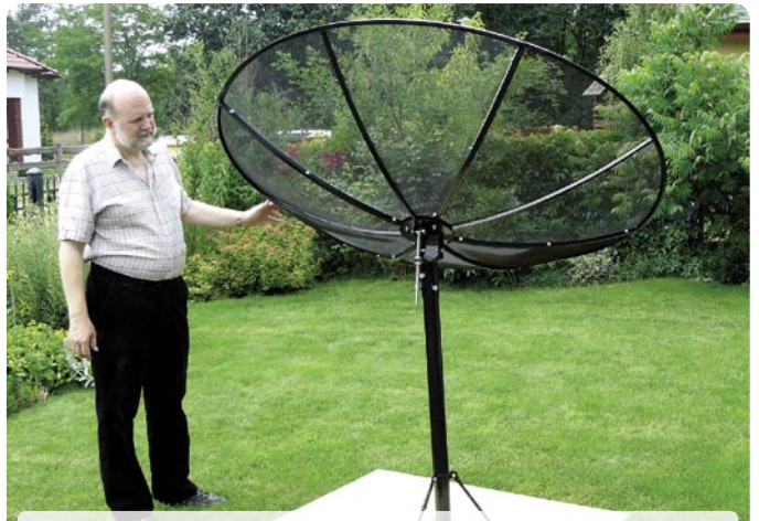
Well done, all parts fit, now the electronic parts