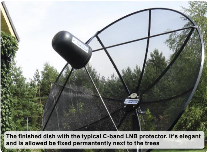
The finished dish with the typical C-band LNB protector. It's elegant and is allowed to be fixed permanently next to the trees