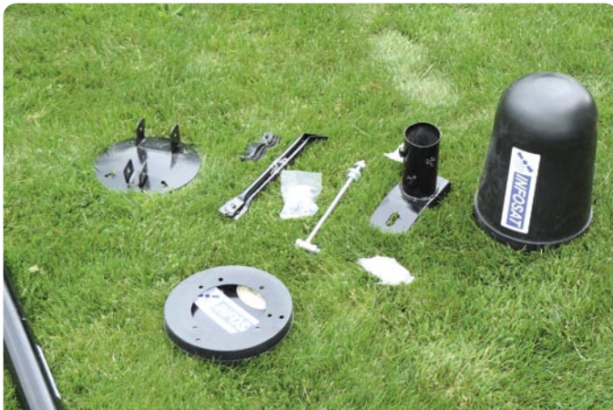
...and so is the rest of the package