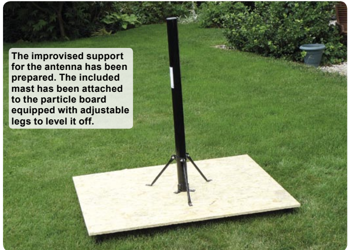
The improvised support for the antenna has been prepared. The included mast has been attached to the particle board equipped with adjustable legs to level it off.