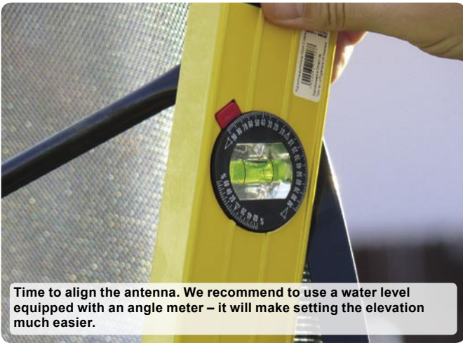
Time to align the antenna. We recommend to use a water level equipped with an angle meter – it will make setting the elevation much easier.